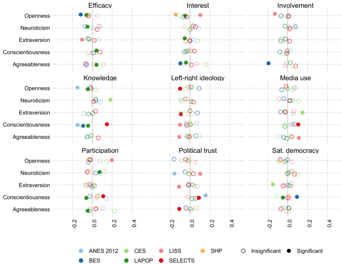
Figure 2: Parameters from interaction tests, students. Statistical tests for significant differences in the correlation between personality traits and political variables among students and the representative sample. Significant effects are indicated by p < .05 . All estimates are from linear regression models. For more detailed results, see supplementary material C. Filled rectangles represent significant effects, whereas unfilled rectangles represent non-significant effects. BES, British Election Study; SHP, Swiss Household Panel; LISS, Longitudinal Internet Studies in the Social Sciences; LAPOP, Latin American Public Opinion Project; SELECTS, Swiss Election Study; CES, Canadian Election Study; ANES, American National Election Study; Sat. democracy, Satisfaction with Democracy. High scores on ideology represent more conservative responses.

Figure 3 shows similar results for internet users. Again, there were no interactions that were particularly replicable. Only two relationships (participation with both Agreeableness and Neuroticism) had interaction effects in a consistent direction for all six samples, but with only one significant moderation apiece, interpreting these results is premature. Perhaps the most intriguing